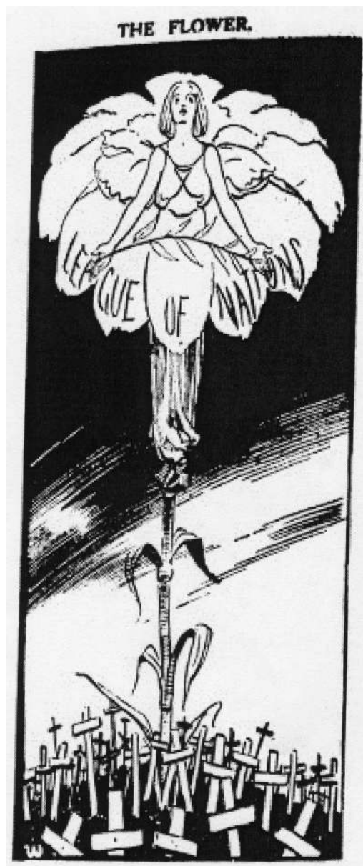
A British cartoon published in November 1919.