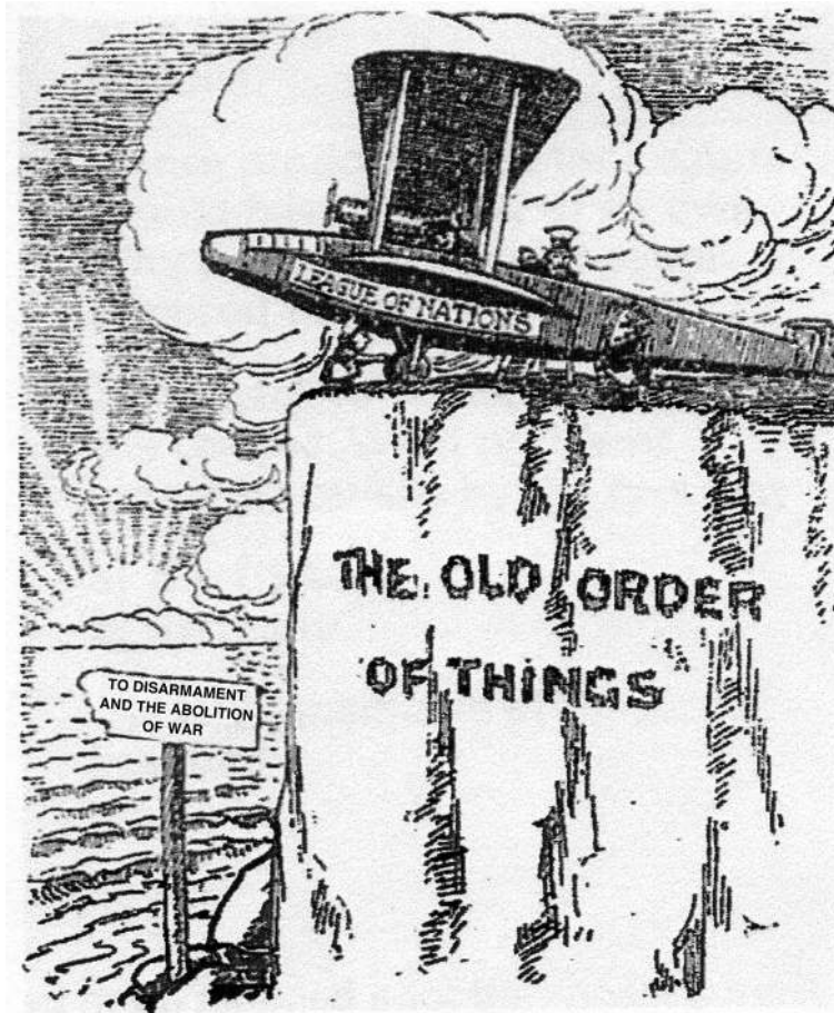
A British cartoon published in 1919.